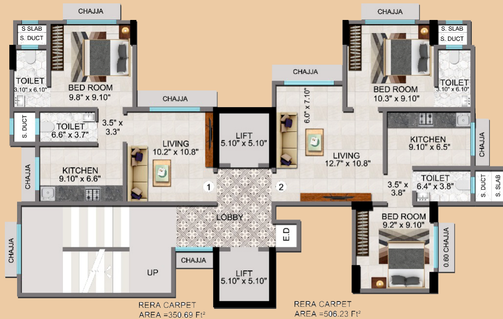
4TH TO 7TH & 9TH TO 11TH FLOOR PLAN