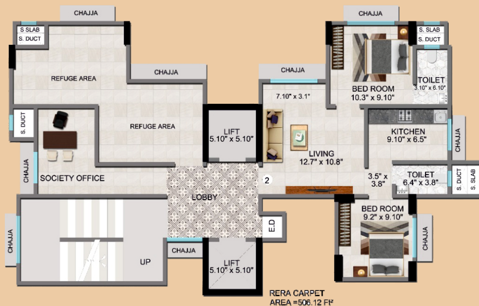
8TH FLOOR PLAN (REFUGE AREA)