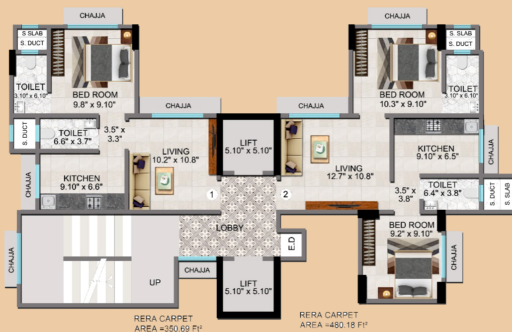
2nd & 3rd FLOOR PLAN